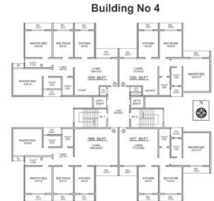
Building No 4